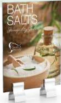
(2) VCTP Table Top