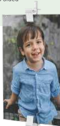
VCMCT1-S One sided clamp stand

Specify: Color* -S Satin Silver or -B Matte Black