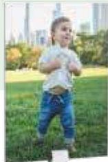
VCMTE-S 15" - 24" Telescopic clamp stand