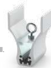
VCCD Clamp has integral eye hook for ceiling drops.