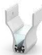
VCWM Features hole for mounting parallel on a wall.