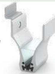
VCSW Clamp with integral slot wall bracket included.