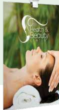
VCDP • Steel grid clip, telescopic tube 20" - 36". Aluminum clamp included