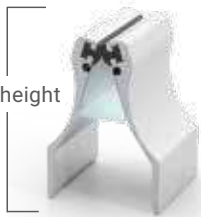
VCTP Clamp only, use on table top, or for small signs.