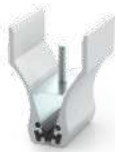
VCMT Clamp with male 1/4-20 thread, multifunctional.