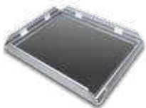
Laser Cut Bases

Front load, includes matte lens & styrene back.