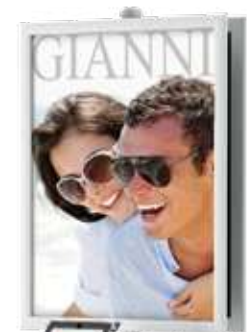
Drop-In Perflex Frames