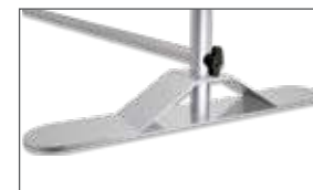
Sturdy Steel "Bridge" Support Base.

Note: For heavy weight vinyls & graphics, special order uprights with B locks. Extra cost applies.