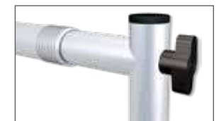
Twist lock offers infinite horizontal and vertical adjustments.