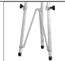
Legs telescope, and easel folds together.

...A great alternative to more costly aids and techniques.