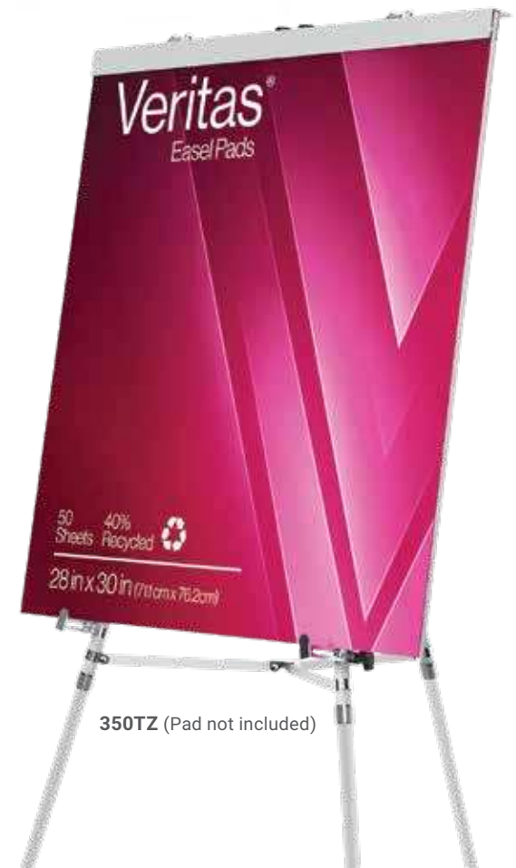
350TZ (Pad not included)