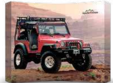
Curved Presto Frame PFK43C , GF43BC graphic with end panels.

Presto Pop-Up displays are ultra easy to set-up and the amazing quality dye sub graphic ensures maximum impact.