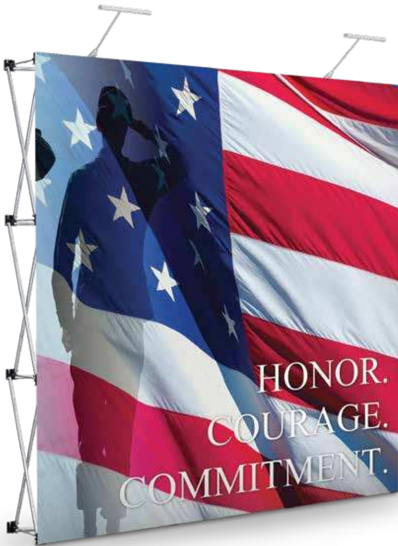
PFK33 with GF33A graphic and (2) LEDPU accessory lights.