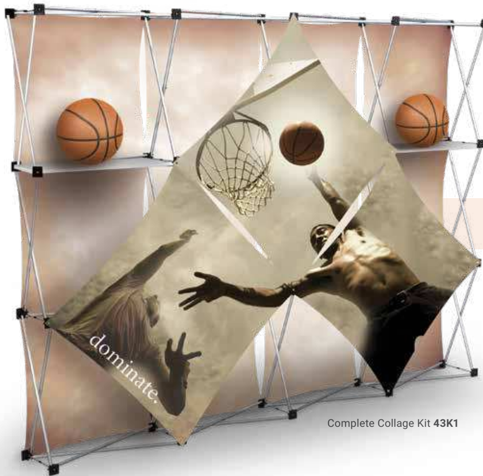
Complete Collage Kit 43K1