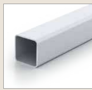
1" square aluminum, quick, tool-free assembly.