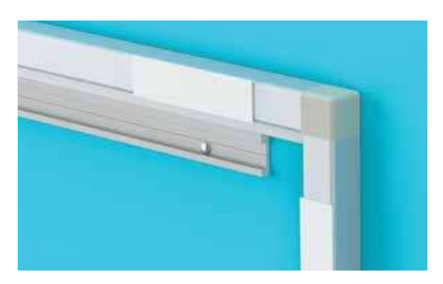
Graphic attaches to StandOff Mount with High Bond Tape.