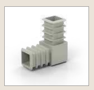
Right angle push in corners.