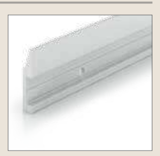
Wall mount cleat includes mounting holes.

Security options available to "lock" frame to wall.