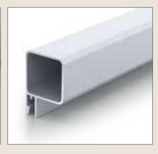
Top section hangs from wall cleat.