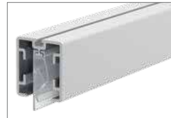
SN2 SnapGraphics .070" capacity.