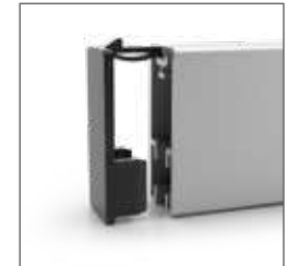
SN1, SN5 end caps have spring retention feature.