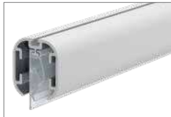
SN1 SnapGraphics .070" capacity.