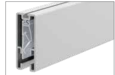
SN5 SnapGraphics .050" capacity.