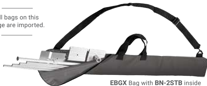
EBGX Bag with BN-2STB inside