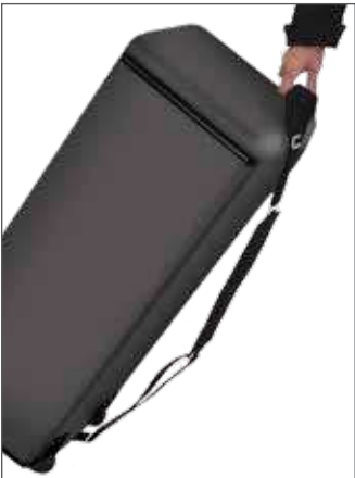
Pull handle and side strap.

Light weight soft padded bag with protection rigid liner