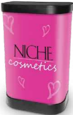
OPC1 & GFW1