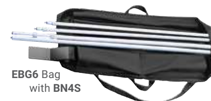
EBG6 Bag with BN4S

EBGC 22" x 4" x 3" bag for Cascade Lights only.