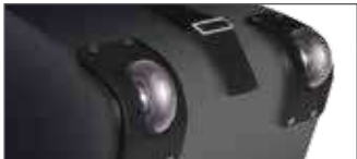
Wheels have protective outer enclosures.