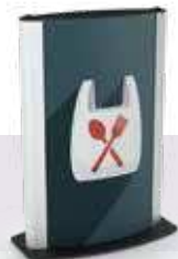
Table top available Qty 25+ Ideal for food service

↓ .040" to .060" thick Styrene Suggested ↑