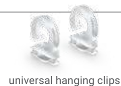
universal hanging clips