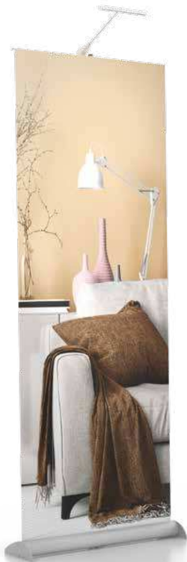
RY1-S with LEDBR1 light.