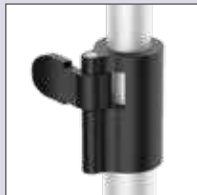
"G" Lock allows quick height adjustments.

Tremendous value & still made in the USA!