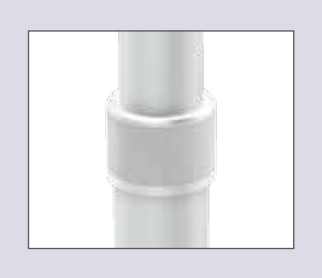
Solid aluminum adjustable clutch lock.