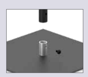
Bases feature solid support bushing.